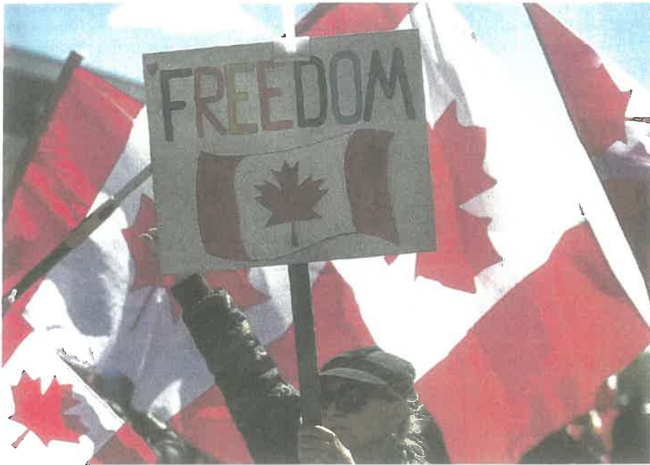
Freedom convoy: Truckers trekked across Canada in early 2022, rallying freedom-lovers from British Columbia to Nova Scotia to protest Covid lockdowns and mandates.